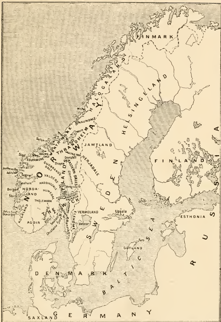
NORWAY IN THE TIME OF HARALD