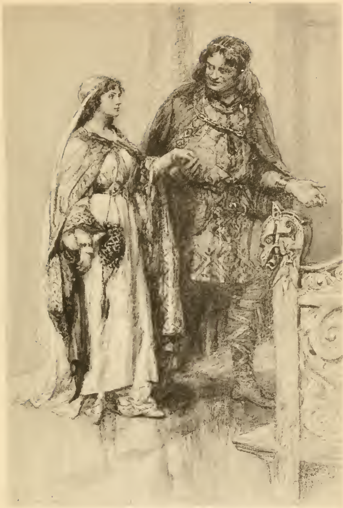
Rolf and the King's daughter, Gisla.