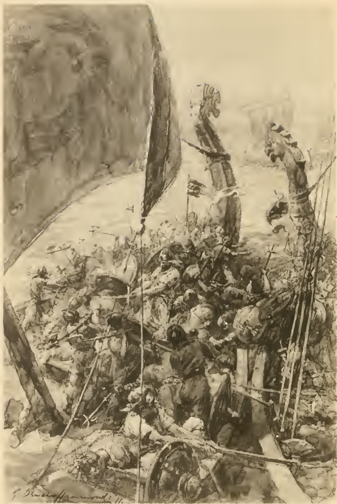
Harald slays King Arvid. (page 86)