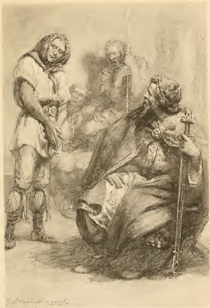
The spy shifted his feet, and looked uncomfortable.